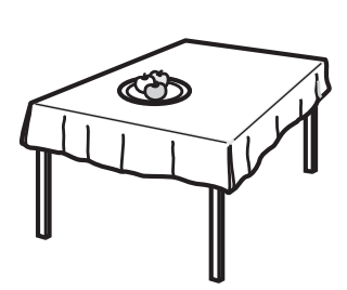
Table linen (tablecloth, runner, placemat)